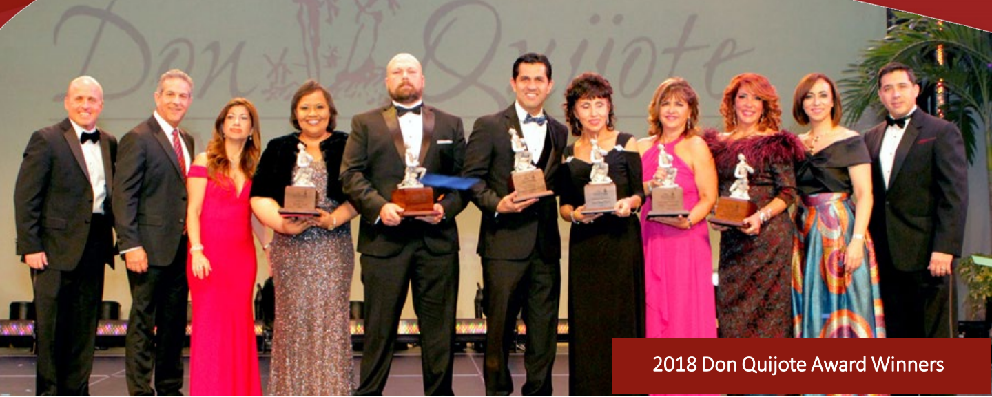
2018 Don Quijote Award Winners

The Don Quijote Awards Gala was conceived in 1997, by a group of visionaries from the Hispanic Chamber of Commerce or Metro Orlando (HCCMO) . And Prospera